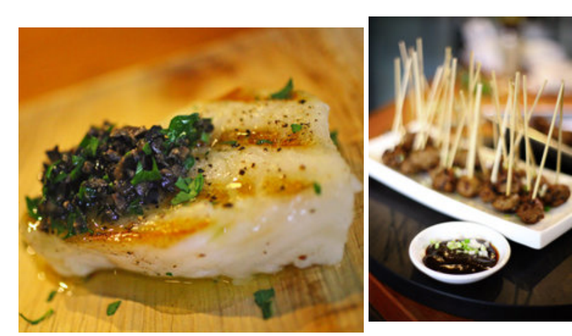
Sea Bass with Lemon & Capers