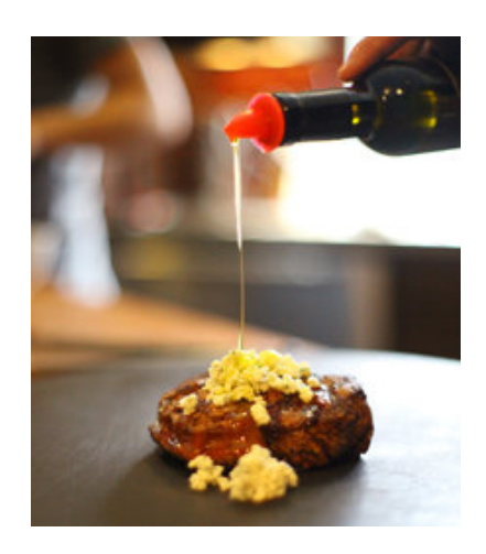
Sam's Favorite Way to Eat Steak

<u>Download</u> Sam the Cooking Guy: Just Grill This! ...pdf